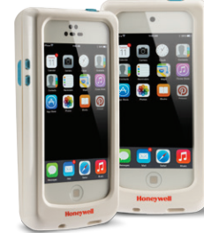
Healthcare variants for iPod® touch and iPhone® 5/5s