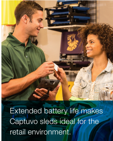
Extended battery life makes Captuvo sleds ideal for the retail environment.