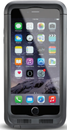
SL42 iPhone® 6/6 Plus