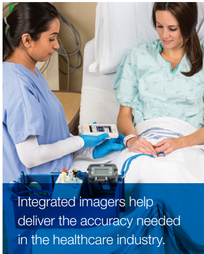
Integrated imagers help deliver the accuracy needed in the healthcare industry.