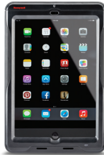
SL62 iPad® mini