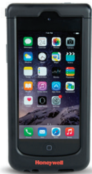
SL42 iPhone® 5/5s